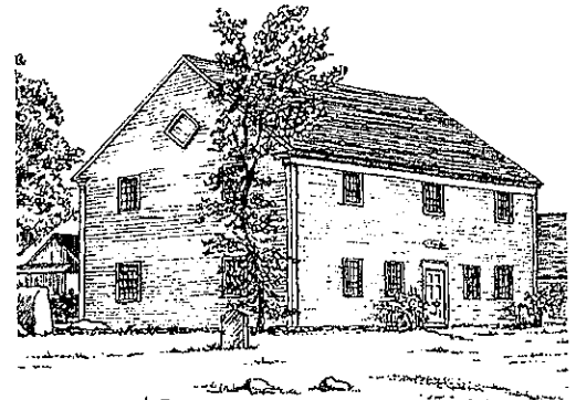
An early Planter building in Barrington

Above article: Crowell's "History Barrington Township," http://en.wikipedia.org/wiki/New-England_Planters