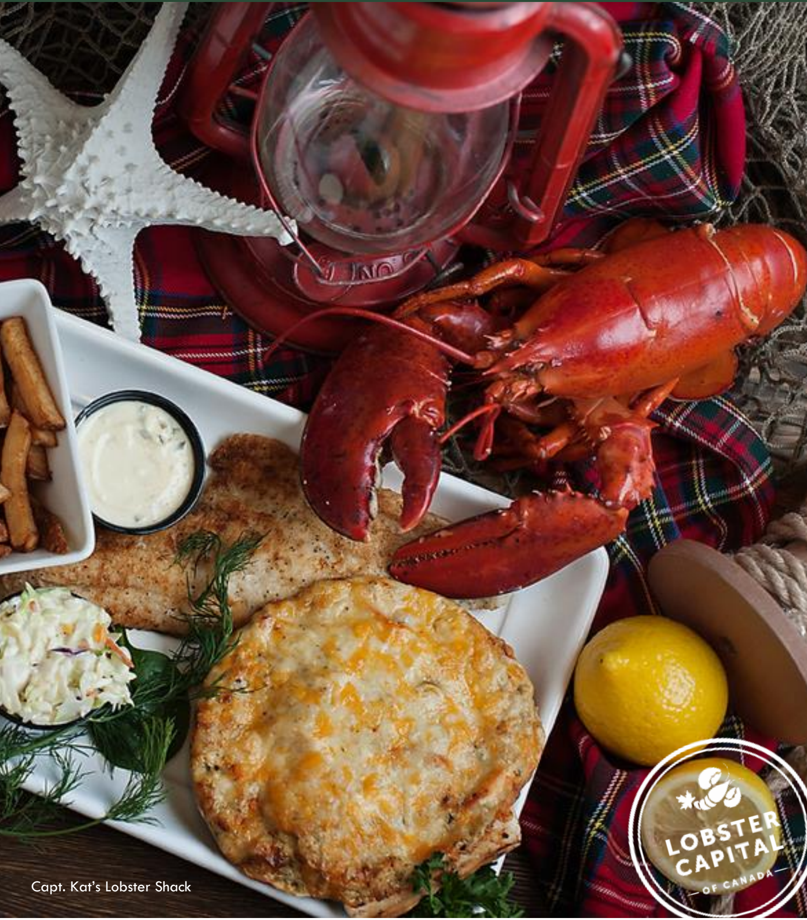
Capt. Kat's Lobster Shack